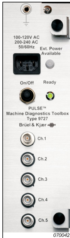
Fig. 2 Top panel connectors and indicators

The five input sockets (Ch. 1 to Ch. 5) on the top plate are duplicates of the connectors on the PULSE front-end, providing easy access without having to lift the top plate. All connections between the top plate, acquisition unit and PC are factory installed.