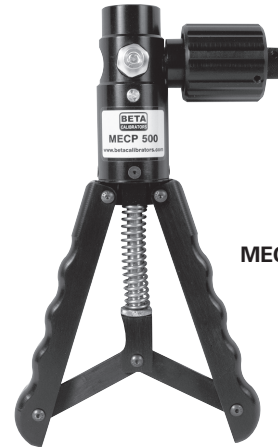
MECP-500 Hand Pump