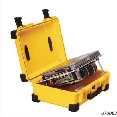
Fig. 1 The PULSE Machine Diagnostics Toolbox with the front-end installed in the bottom compartment

Type 9727 is a compact and portable case consisting of all the hardware required for field testing and analysis, including: