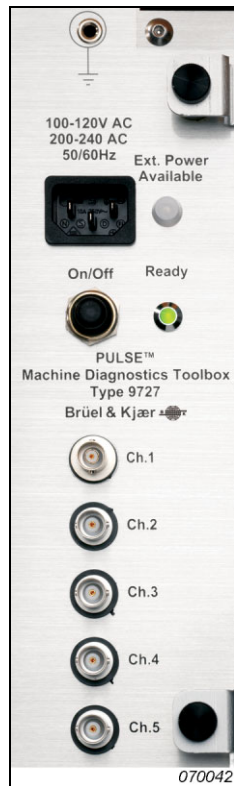
Fig. 2 Top panel connectors and indicators

The five input sockets (Ch. 1 to Ch. 5) on the top plate are duplicates of the connectors on the PULSE front-end, providing easy access without having to lift the top plate. All connections between the top plate, acquisition unit and PC are factory installed.