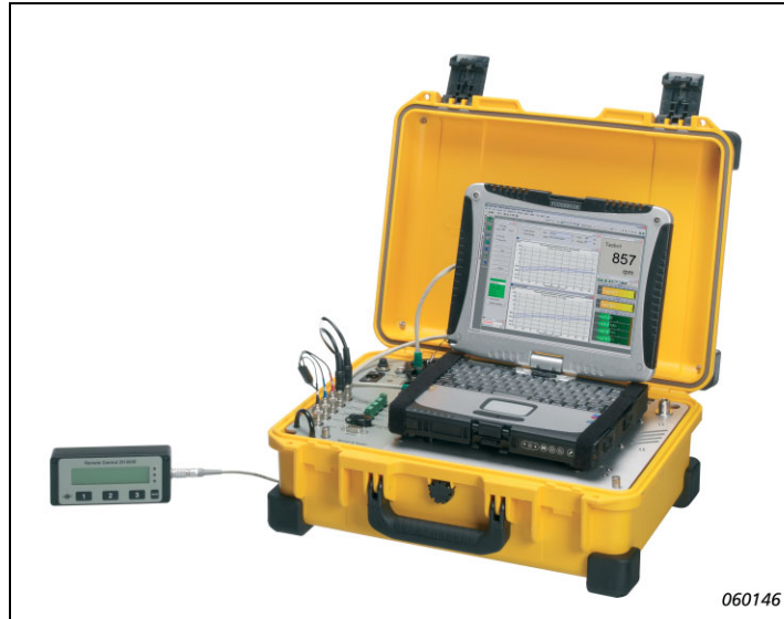
Fig. 2 Optional Hardware including PULSE In- vehicle Box Type 3643 and PULSE Remote Control ZH-0630

Test results are auto-saved at the end of a test. The most recent results and any previous measurements, can be overlaid; multiple runs can be averaged together; and reports can be made using a single mouse click, removing the need for various additional operations with tools such as Microsoft® Excel. All compatible datasets can be easily compared and reported. Target curves can also be added to improve data evaluation.