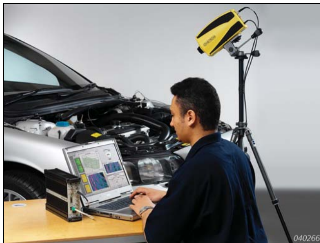
Fig. 2 Type 8338 connected to Type 3560-B PULSE Multi-analyzer for vibration measurement on a car engine

Type 8338 can be powered by the optional External Battery Pack ZG-0449 for portable applications like predictive maintenance of machinery, or by a 12 V power supply (via cigarette lighter connector) for in-vehicle applications like body panel radiation analysis. When direct line of sight from the instrument to the target is not achievable, you can make use of mirrors to redirect the laser beam. High-quality mirrors can be ordered as an option and are supplied with mounting magnets.