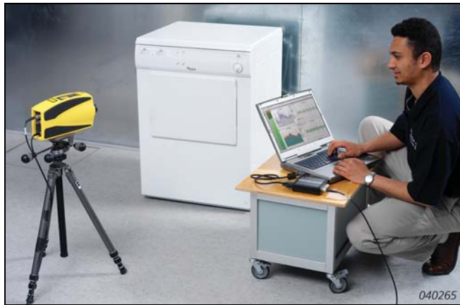
Fig. 1 Measuring on a washing machine with Type 8338

PULSE allows the user to perform precise vibration analysis of the output velocity signal through easy-to-use, intuitive software as well as through high quality acquisition hardware. One can then perform time-domain analysis, FFT analysis, octave analysis, impact resonance testing or even order tracking analysis.